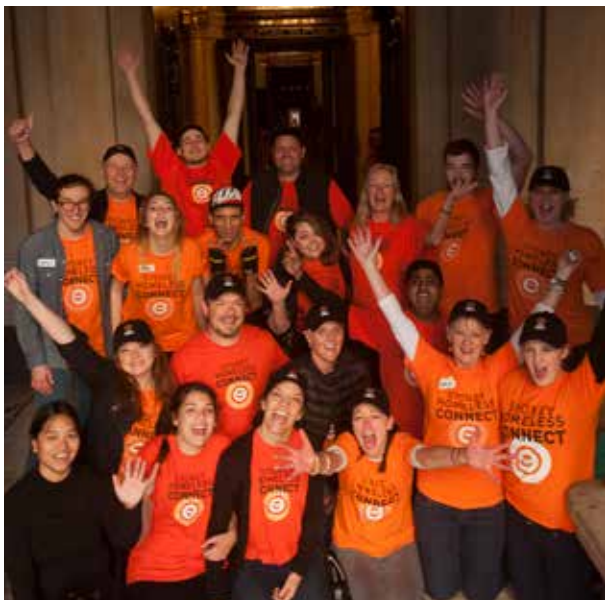
Sydney Homeless Connect's core team.

Our core team is a small group of passionate and dedicated volunteers who donate their time, energy, love and resources to making a positive impact on homelessness in Australia. As a not-for-profit charity, Sydney Homeless Connect is powered 100% by volunteers, donations and kindness.